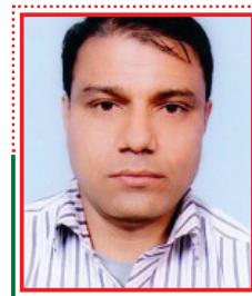
Dr. Pradip Gyawali Member